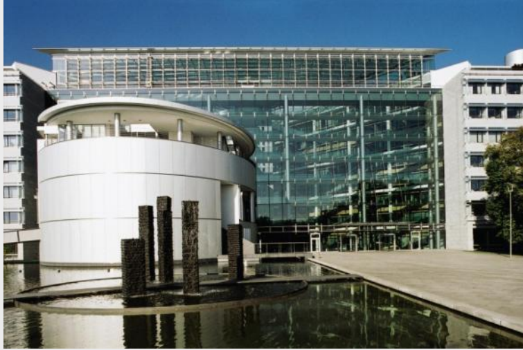
Boehringer Ingelheim Center Our headquarters in Ingelheim, Germany