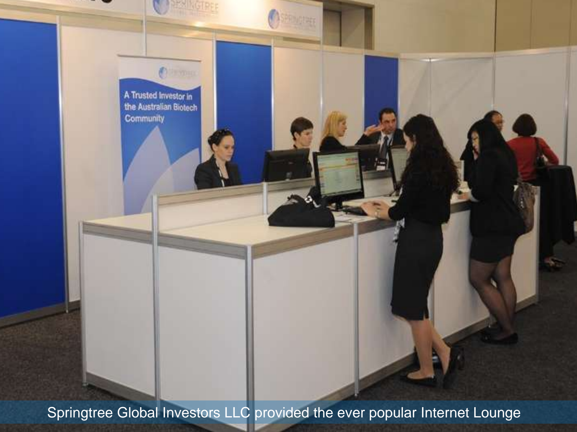
Springtree Global Investors LLC provided the ever popular Internet Lounge